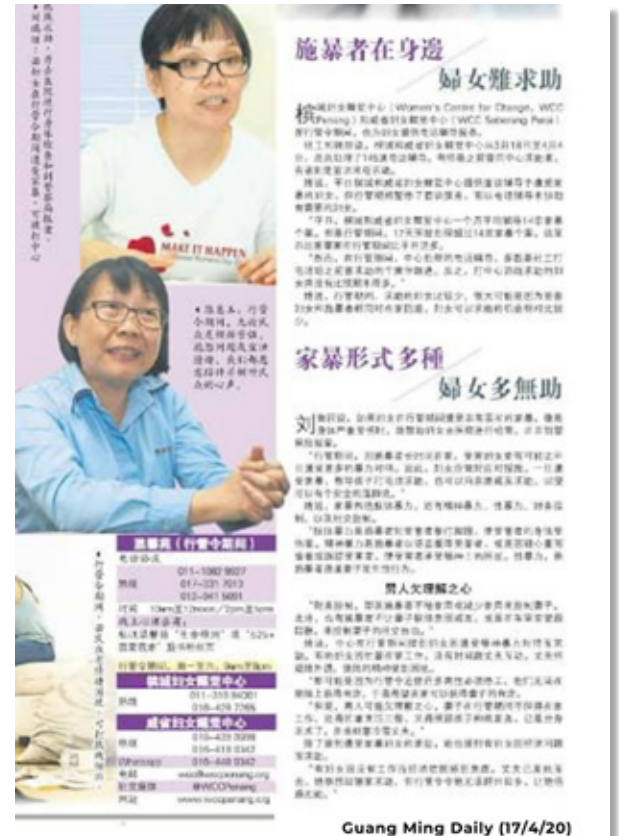
Guang Ming Daily (17/4/20)