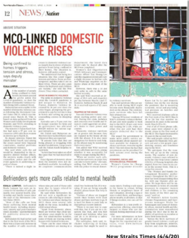
New Straits Times (4/4/20)